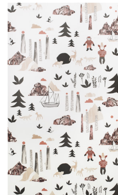
Pattern: Coastal collage/Sand Design by Anna Backlund Printed on WallSmart wallpaper (non-woven fleece). L: 1005 cm, W: 53 cm, Report: 53 cm Item code: 7017