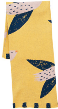
Pattern: Bye bye birdie/Yellow Design by Catrin Blomqvist 100% soft organic cotton. Knitted. Size: 80 x 100 cm. Item code: 2175