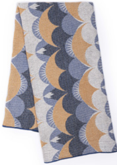
Pattern: Eternal sunset/Blue Design by Anna Backlund 100% cotton. Jacquard woven. Size: 100 x 100 cm. Item code: 2070