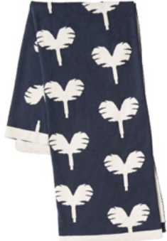
Pattern: Never grow up/Blue Design by Anna Backlund 100% soft organic cotton. Knitted. Size: 80 x 100 cm. Item code: 2143