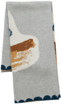
Pattern: Sail away silly/Grey Design by Anna Backlund 100% soft organic cotton. Knitted. Size: 80 x 100 cm. Item code: 2173