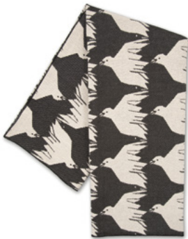
Pattern: Birdie nam nam/Black Design by Cecilia Pettersson 100% cotton. Jacquard woven. Size: 100 x 100 cm. Item code: 2065