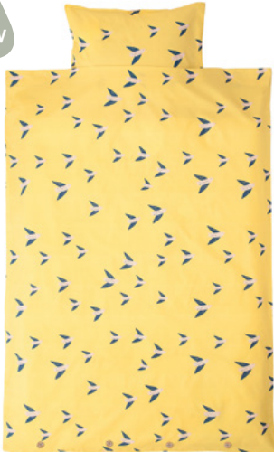
Pattern: Bye bye birdie/Yellow Design by Catrin Blomqvist 100% organic cotton. Coconut buttons. Size: 70 x 100 cm + 46 x 40 cm. Item code: 2185 Size: 100 x 140 cm + 55 x 35 cm. Item code: 2186