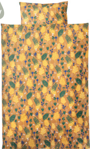
Pattern: Leaves & petals/Brown Design by Anna Backlund 100% organic cotton. Coconut buttons. Size: 70 x 100 cm + 46 x 40 cm. Item code: 2161 Size: 100 x 140 cm + 55 x 35 cm. Item code: 2162