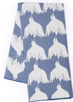
Pattern: Birdie nam nam/Blue Design by Cecilia Pettersson 100% cotton. Jacquard woven. Size: 100 x 100 cm. Item code: 2071