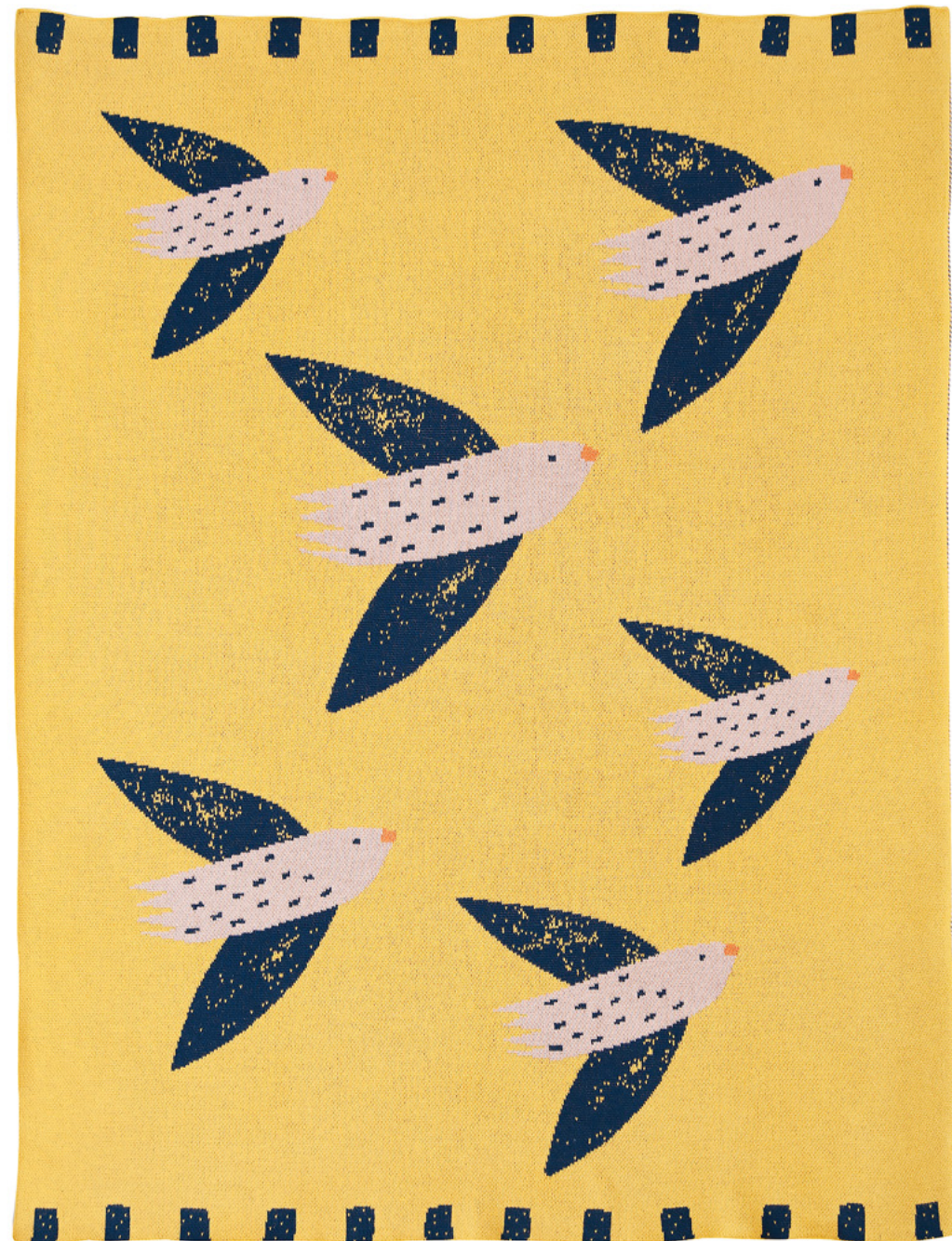
Bye bye Birdie! And welcome to Snugglers' paradise! A super cute, super soft baby blanket in knitted organic cotton.