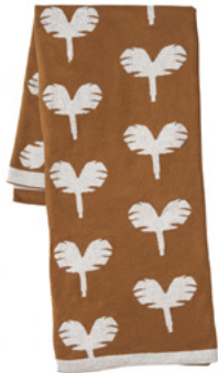
Pattern: Never grow up/Mustard Design by Anna Backlund 100% soft organic cotton. Knitted. Size: 80 x 100 cm. Item code: 2142