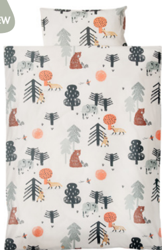
Pattern: Friendly forest/Grey Design by Catrin Blomqvist 100% organic cotton. Coconut buttons. Size: 70 x 100 cm + 46 x 40 cm. Item code: 2163 Size: 100 x 140 cm + 55 x 35 cm. Item code: 2164