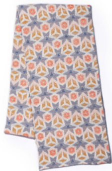
Pattern: Anemone tribe/Peach Design by Anna Backlund 100% cotton. Jacquard woven. Size: 100 x 100 cm. Item code: 2072