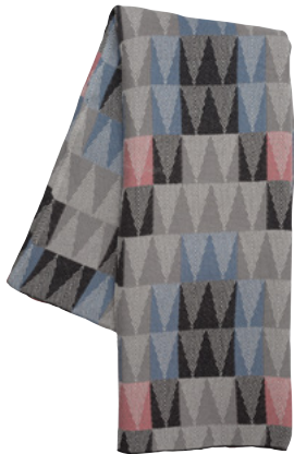
Pattern: Fir fir forest/Grey Design by Anna Backlund 100% cotton. Jacquard woven. Size: 140 x 240 cm. Item code: 2097