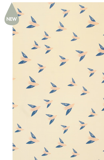
Pattern: Bye bye birdie/Sand Design by Catrin Blomqvist Matte surface. L: 300 cm, W: 180 cm Panel width: 45 cm Item code: 7019