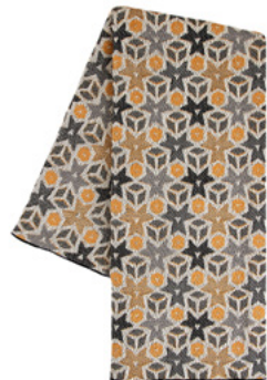
Pattern: Anemone tribe/Orange Design by Anna Backlund 100% cotton. Jacquard woven. Size: 100 x 100 cm. Item code: 2118