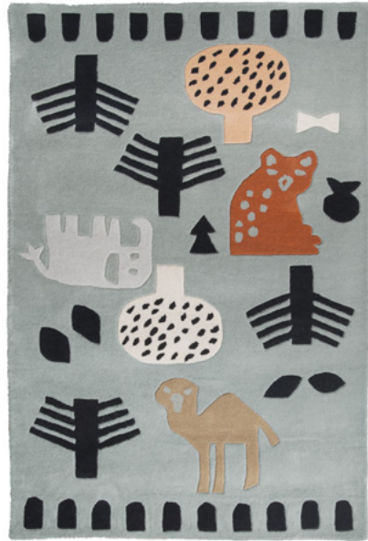
IN THE JUNGLE/GREY Design by Catrin Blomqvist Hand tufted rug. 100% wool. Size: 120 x 180 cm. Item code: 5016