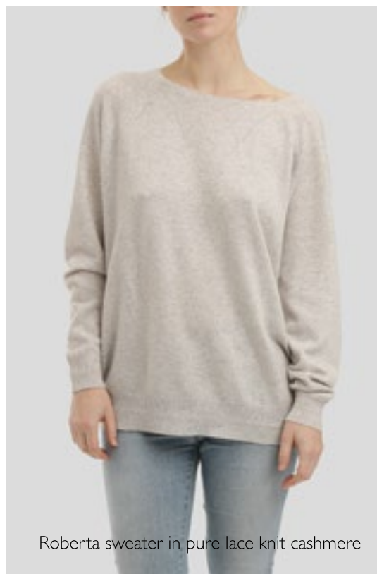
Roberta sweater in pure lace knit cashmere