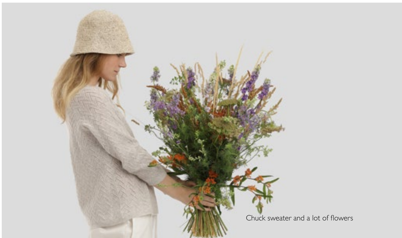
Chuck sweater and a lot of flowers