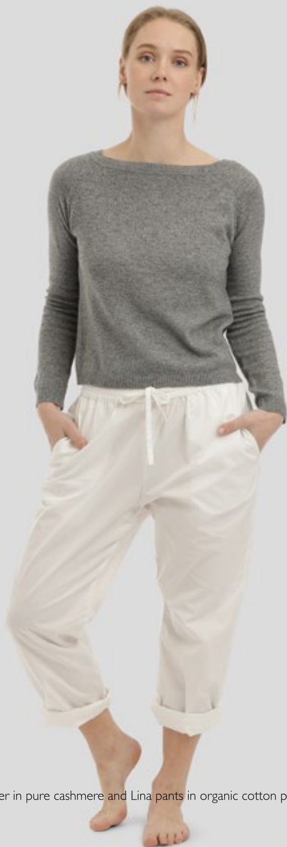
Joy sweater in pure cashmere and Lina pants in organic cotton poplin