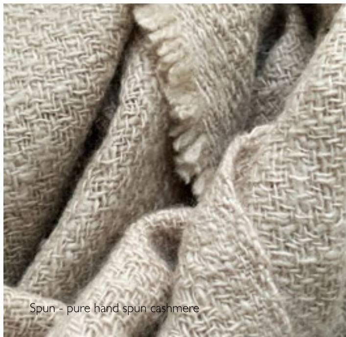
Spun - pure hand spun cashmere