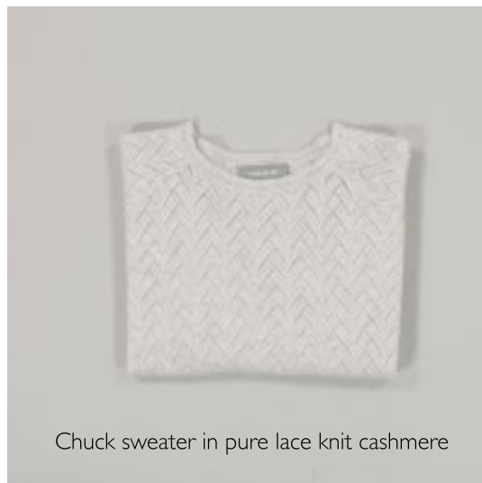
Chuck sweater in pure lace knit cashmere