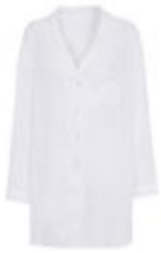
IN-300-750/40-100 Vivienne long shirt 100% organic cotton gauze S-M-L