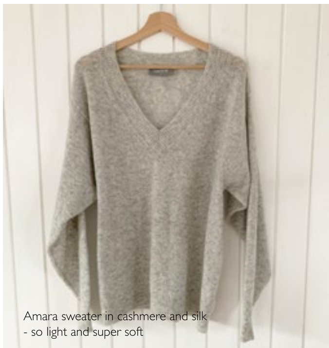
Amara sweater in cashmere and silk - so light and super soft