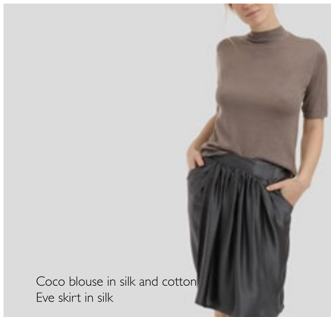
Coco blouse in silk and cotton Eve skirt in silk

EVE skirt is made in pure silk and fits very well with all our tops.