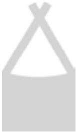
NP-150-375/22-55 Hang 100% linen OS