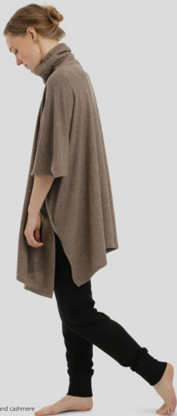
Vanessa poncho in wool and cashmere