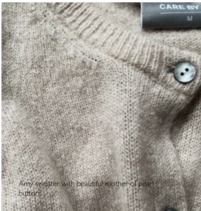
Amy sweater with beautiful mother of pearl buttons