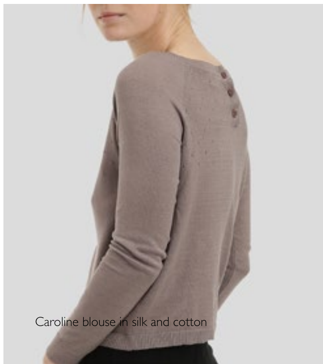
Caroline blouse in silk and cotton