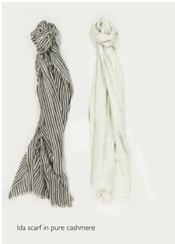
Ida scarf in pure cashmere