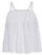
IN-160-400/22-55 Vivienne top 100% organic cotton gauze OS